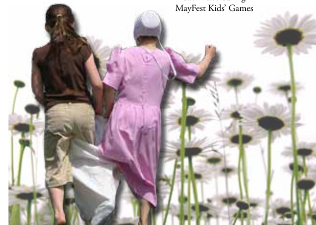
Sack Race during MayFest Kids' Games